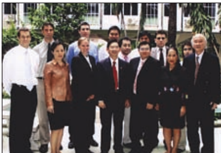
Thammasat University law faculty, law firm representatives, and UWLS summer interns

The Center is pleased to offer JD students a variety of work and research opportunities, such as the Bangkok Summer Internship (in cooperation with Thammasat University), short courses with universities in East and Southeast Asia, and travel research grants.