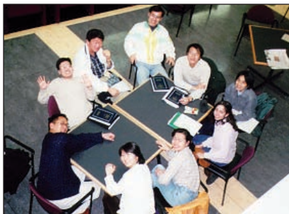
MLI students at a study session

After receiving the MLI degree, some students focus on research and thesis projects in the Law School's LLM or SJD programs.