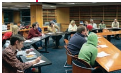
At the UW Law School

The Center is pleased to offer JD students a variety of work and research opportunities, such as the Bangkok Summer Internship (in cooperation with Thammasat University), short courses with universities in East and Southeast Asia, and travel research grants.