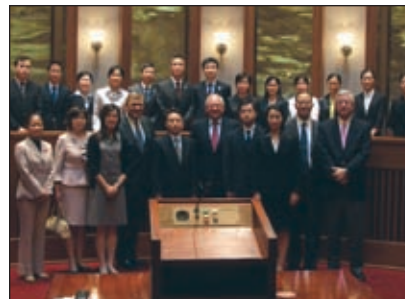
Participants in the Judicial Skills Training Seminar, 2007, at the Minnesota Supreme Court

The Center has organized and sponsored or co-sponsored numerous professional programs for almost two decades. These programs have taken place in Madison and also at other universities and locations.