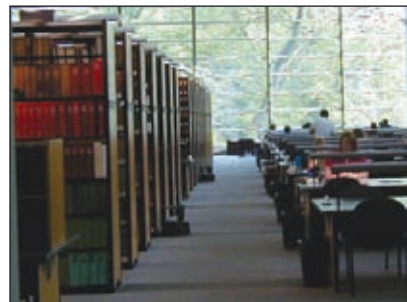
Law Library Grand Reading Room

The Center supplements the extensive collection of the Law Library with additional sources related to the legal systems of countries of East and Southeast Asia.